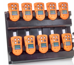
10 way charger For charging and storing your T4 fleet