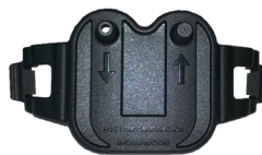
Aspirator plate Sample atmosphere prior to entry