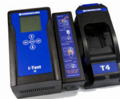
I-Test Easy automated bump testing and calibration solution