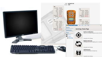
NEW Portables Pro 2.0 Software For easy configuration and servicing