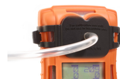
Bump/calibration plate To apply test gas to T4